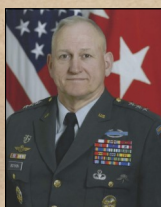
Lt. Gen. Jerry Boykin