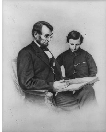
President Lincoln reading to his son, Tad.

Achievement Tests Courses: Middle and High School Curriculum Career-Tech Center (Vo-Tech) College Credit Policy Daily Schedule Outside-Classroom Activities Field Studies Goals/Lesson Plans Grades Grading Scale Graduation Requirements High School Summer Credit Policy Homework Policy Honor Roll P139 Program Library/Media Center Notebook Method Parent/Teacher Conferences Report Cards Retention