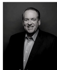
Gov. Mike Huckabee