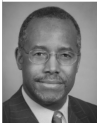
Dr. Ben Carson